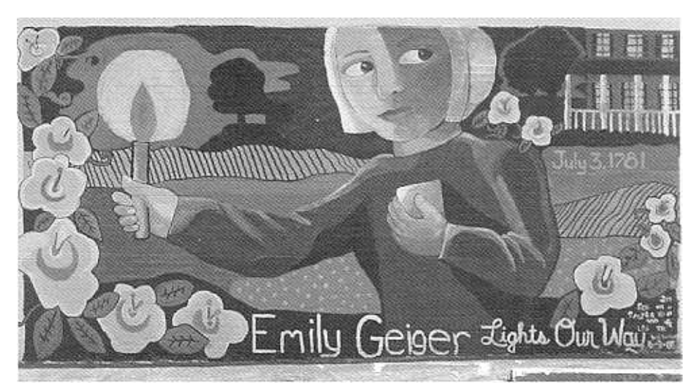
The mural is located in West Columbia on 13th Street between B Avenue and C Avenue.

During the first week of June, 12 young women ages 11 to 16 under the direction of Julie Jacobson, a graduate student in both Women's Studies and fine arts, painted a mural on a dilapidated building in West Columbia. The girls were