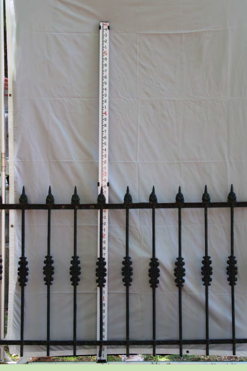
Fence around the Howe family graves.

This internship was heavily focused on library research. While I have had multiple research opportunities in previous classes, none have involved this extent of primary-source research. I hit many dead ends, spending hours on documents that turned out to be useless. But in doing so, I learned how challenging it is to understand and to reconstruct the past. This internship gave me the opportunity to use resources at the South Caroliniana Library, an institution dedicated to the preservation of documents and the cultivation of research. Most of the documents I needed were available only in-person at the Granitville Room, so I was able to gain experiences in reaching out to the archivists working at the library and learned how helpful and knowledgeable they are.