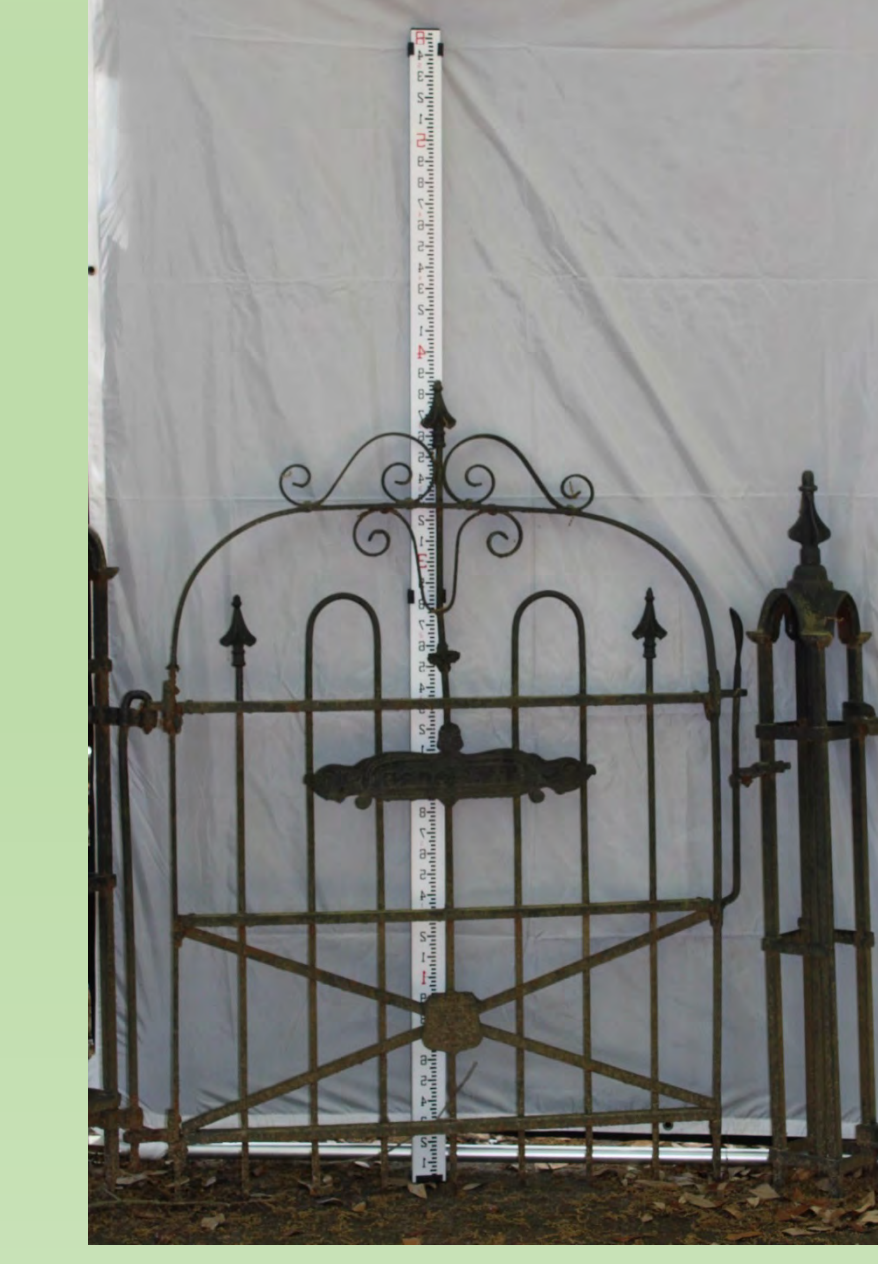
Entrance to the plot that belongs to the Moore family.